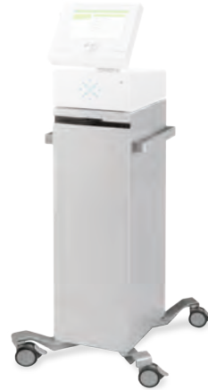
RM01004 Evident Trolley