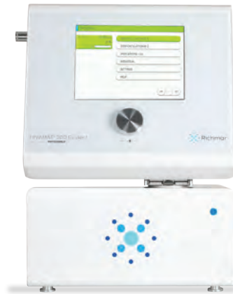
RM02037 Hivamat 200 Evident