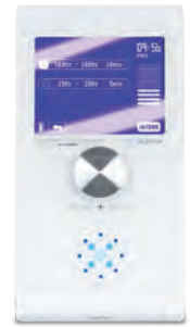
RM01009 Hivamat 200 Portable